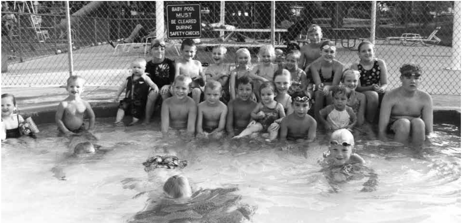
Neighbors enjoyed popsicles and swimming at the CCNA Pool Party July 8 at Irvingdale Pool.