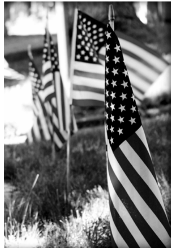
Country Club Neighborhood residents on Bradfield show their patriotism with a display of flags in their yard.