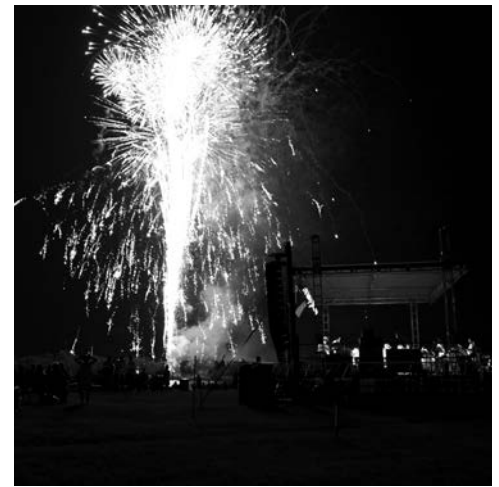
Trinkle Brass Works at the Uncle Sam Jam

Meadowlark Festival was dormant in 2012 due to financial difficulties, however thanks to an engaged and energized Board of Directors and overwhelmingly positive support from past Meadowlark sponsors and patrons, the Meadowlark Music Festival has now begun plans for the 2014 season.