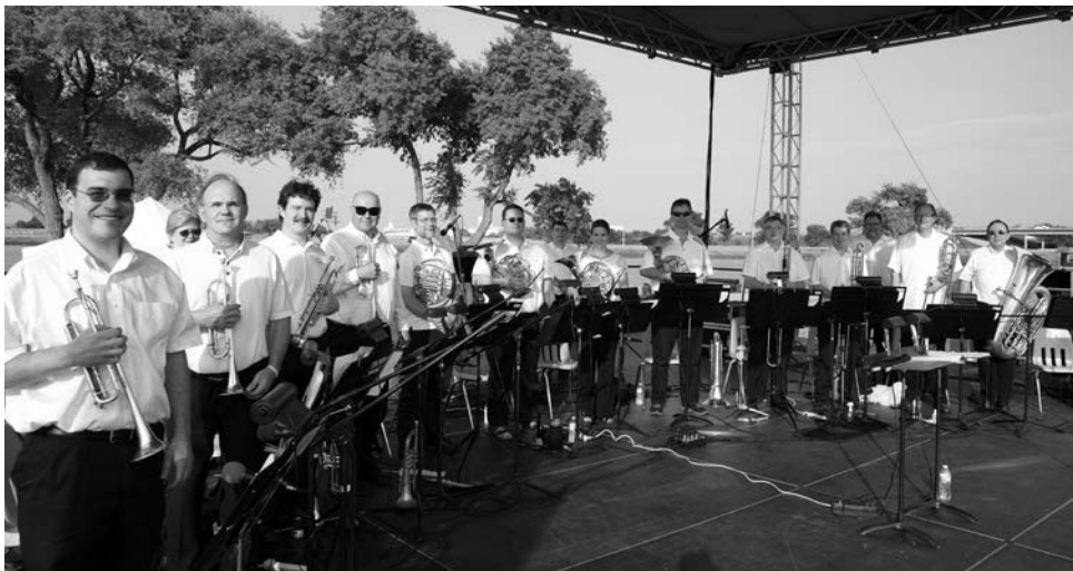
Trinkle Brass Works