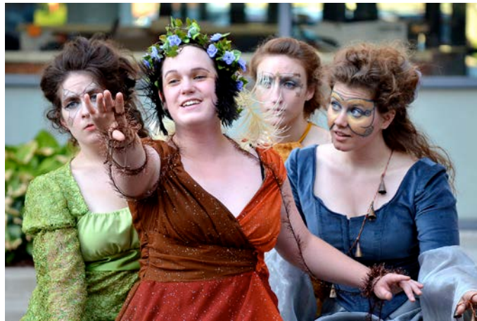
2010's "A Midsummer Night's Dream"

The company intends to perform again in the Swan Theatre in summer 2015. The Wyuka stables building is currently in the