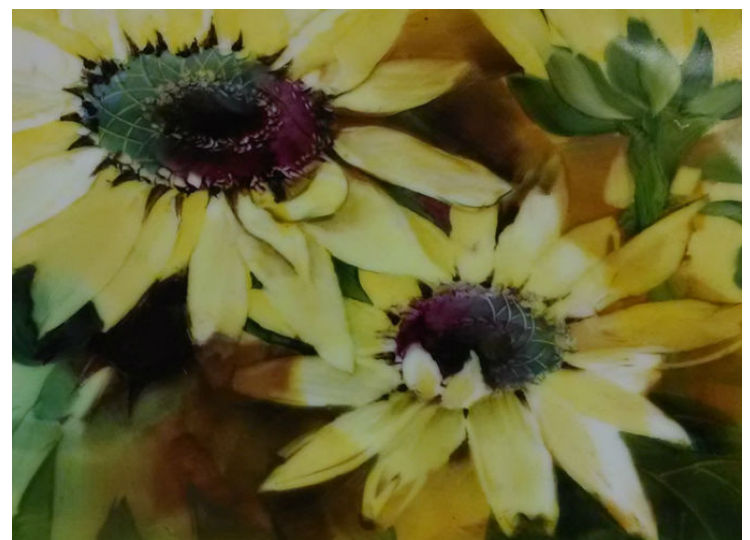
Art work done in the class